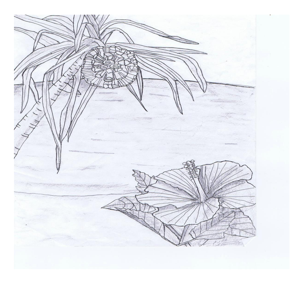
(Sketch from the Yoron Junior High School Art Club May 2014)