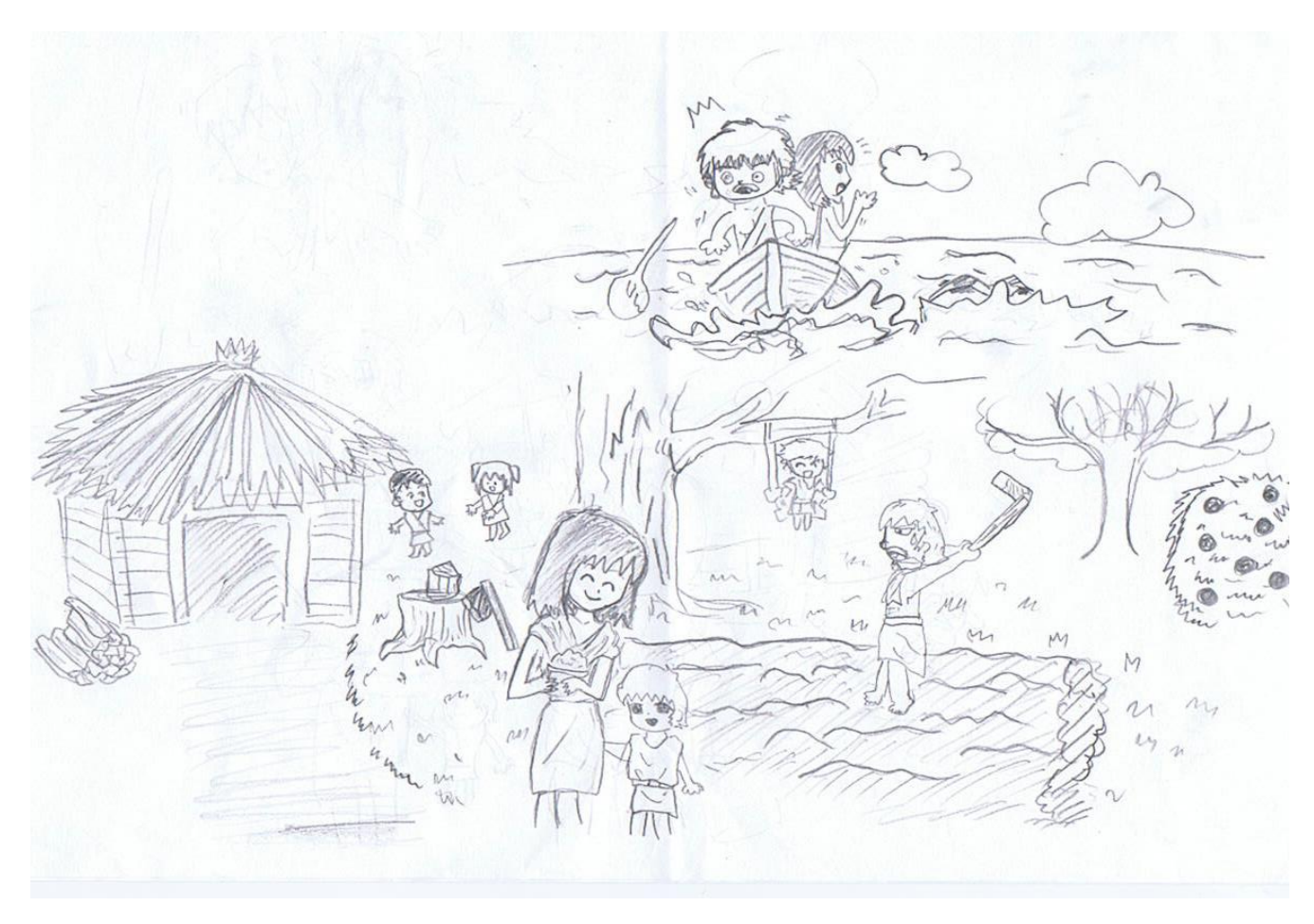
(Sketch of the mythical gods Siniguku and Amamiku with their family from the Yoron Junior High School Art Club May 2014)